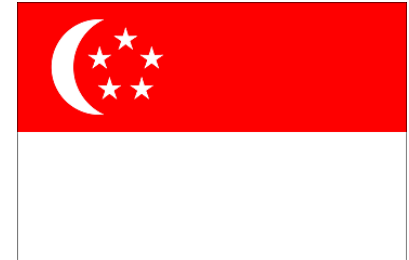
Chair of APWEA Waste Management and Recycling Association of Singapore