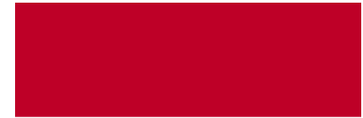
Indonesia Solid Waste Association