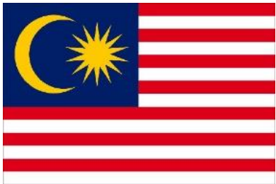
Waste Management Association Malaysia