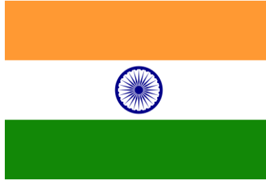
National Solid Waste Association of India