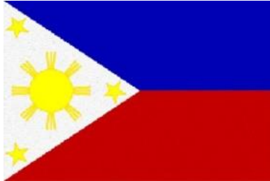
Solid Waste Association of Philippines