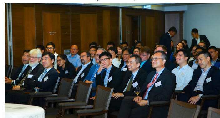
Members and guests enjoying the chairman's report and reception